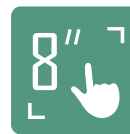
8-inch Multi-touch Screen